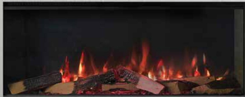
39 RIGHT CORNER