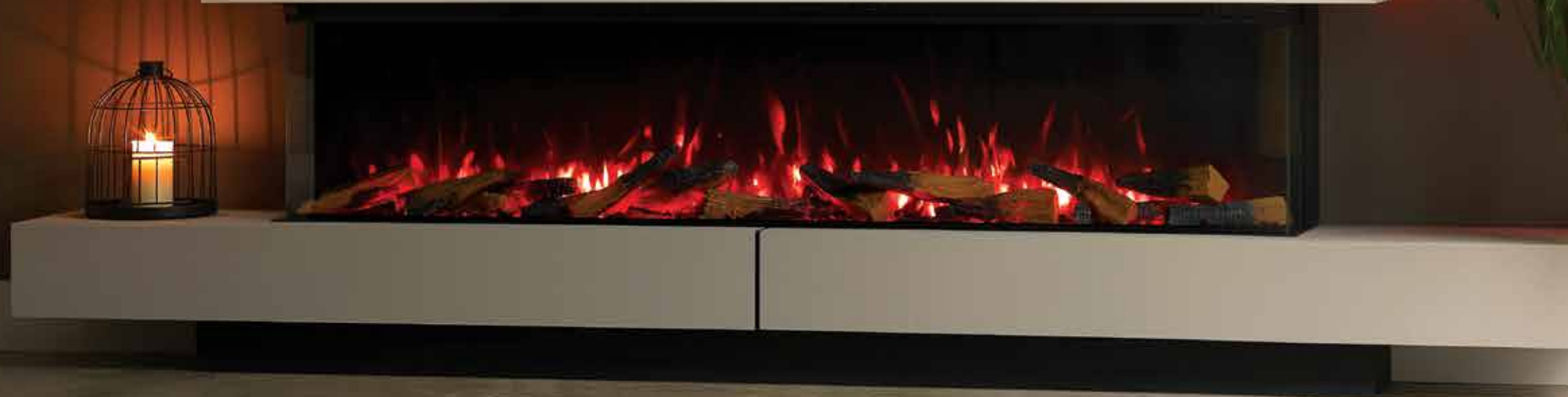
71 BAY WINDOW

Enhance your room's ambiance with our Ambient LED Lighting Kit, creating an interactive and immersive experience. Featuring 15 color modes, this lighting can be effortlessly controlled via the remote or your smart device. Each kit includes two 5-foot RGB LED strips making it an ideal addition to your hearth and media walls.