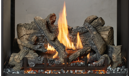
Oak Log Set