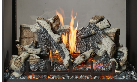
Birch Log Set