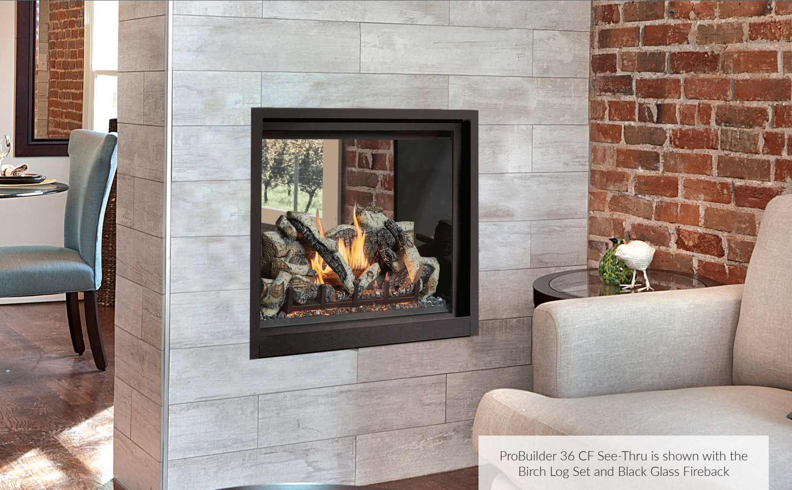
ProBuilder 36 CF See-Thru is shown with the Birch Log Set and Black Glass Fireback

The ProBuilder 36 Clean Face See-Thru Deluxe is the perfect choice for anyone wanting to divide two separate rooms. The unique see-thru design of this fireplace adds visual depth and dimension to any space, while showcasing two stunning views of the fire. The ProBuilder 36 See-Thru is ideal for providing supplemental warmth to spaces up to 1,800 square feet.