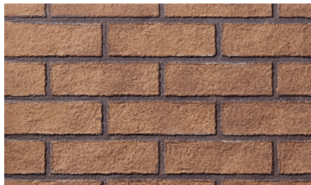
Common Brick Fireback