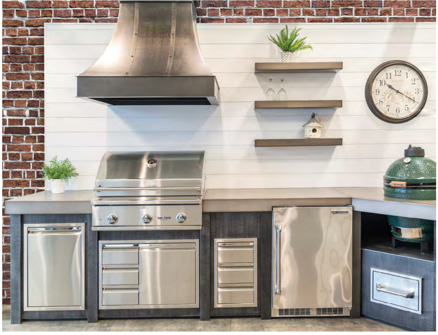
Hood: Brushed Black / Outdoor Kitchen: Brushed Black & Concrete Powdercoat / Aluminum Shiplap: White