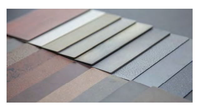
Ask your dealer to see more or go to stollindustries.com

Outdoor-rated powder coats that are durable and beautiful.