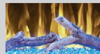
NORTHERN WOOD LOG SET AND CRYSTALS