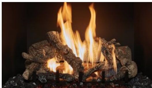
Oak Log Set

Introducing the 864 TV 40K Clean Face, the newest addition to the 864 Family and a true 'best in class' fireplace. This top vent fireplace is perfect for heating homes up to 2,000 square feet, with an ideal 40,000 BTU input and incredible 75% turndown rate. The 864 TV 40K is a Deluxe model featuring high quality ceramic glass, overhead accent lights, amazingly realistic Ember-Glo™ ember bed under-lights and your choice of stunning Birch or Oak Log Sets.