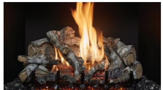
Birch Log Set