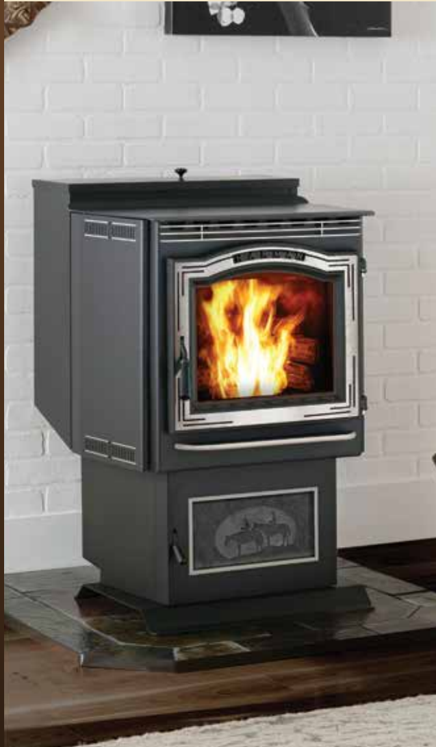
P68 shown with modern brushed stainless trim, black heat shield with brushed stainless accents and Trail Riders Slate Tile.

Upgrade any space. These powerful, high-efficiency pellet stoves and inserts use Harman PelletPro™ and ESP technology to burn any grade of pellet with even heat and precision control. Basic maintenance can also be performed without shutting down the units—for true 24-hour heating.