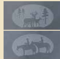
Slate tile accents

Engineering excellence and heating performance make every Harman stove or insert a practical heating solution. “Built to a standard, not a price.”