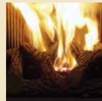
Ceramic log sets