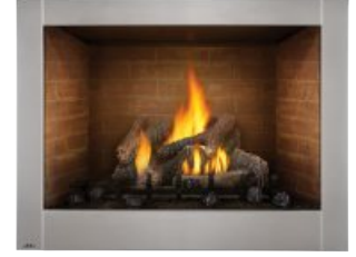
Decorative Sandstone Brick Panels