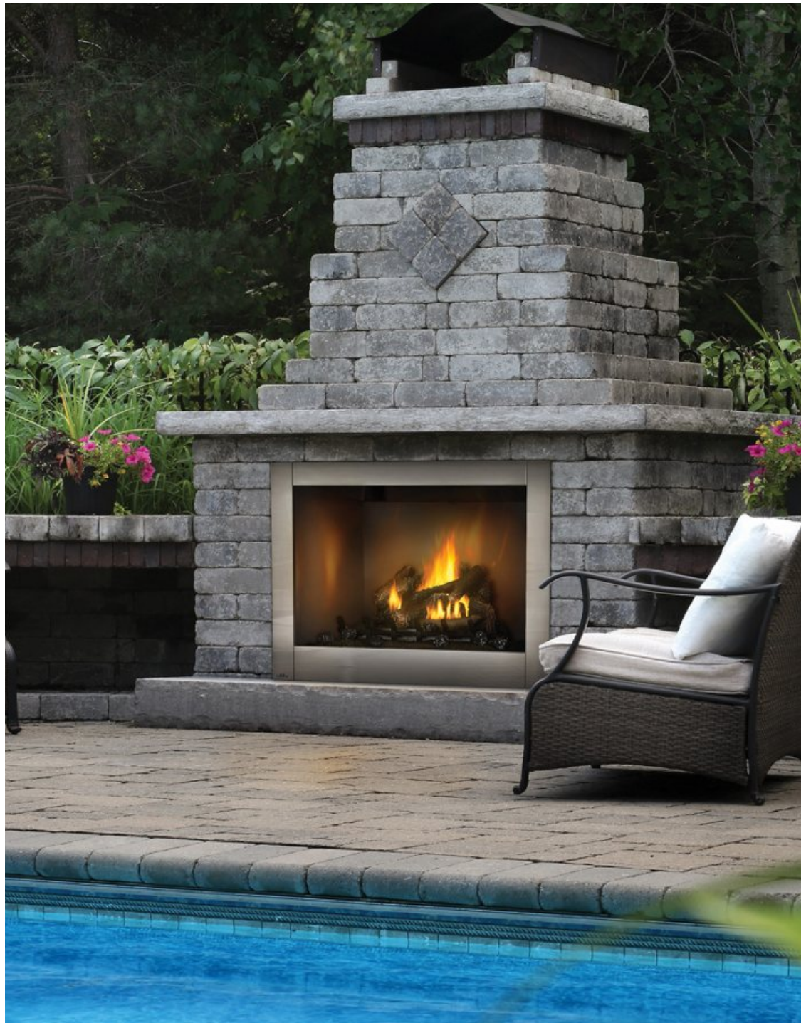
Riverside™ 42 Clean Face