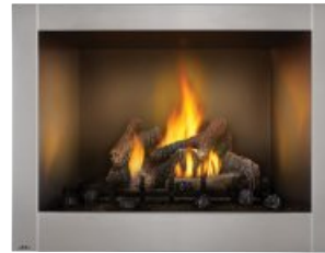
Riverside™ 42 Clean Face