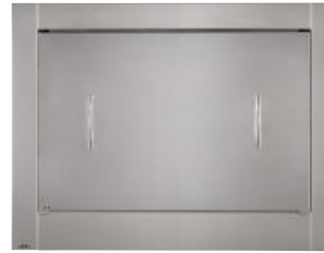
Optional Seasonal Protective Cover