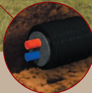
Insulated underground tubing